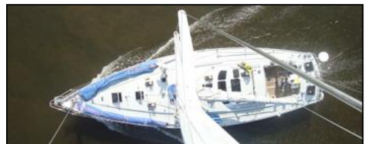
Rozalia Project Research Boat