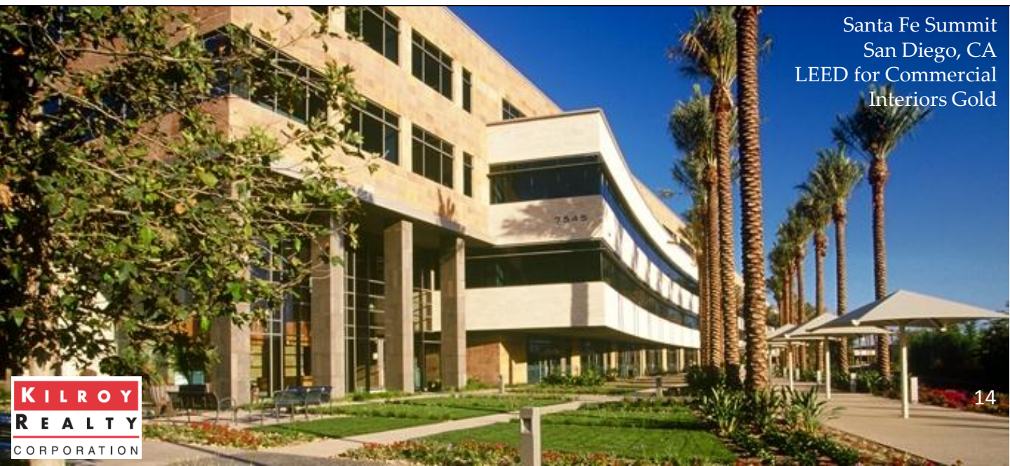
Santa Fe Summit San Diego, CA LEED for Commercial Interiors Gold