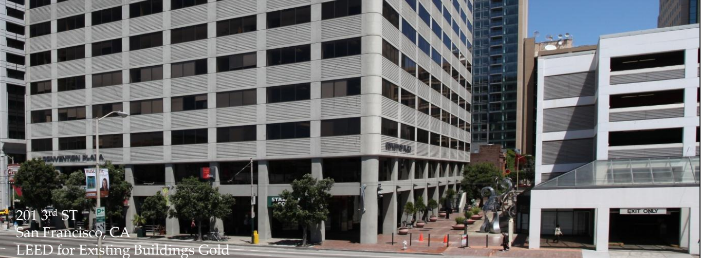
201 3rd ST San Francisco, CA LEED for Existing Buildings Gold