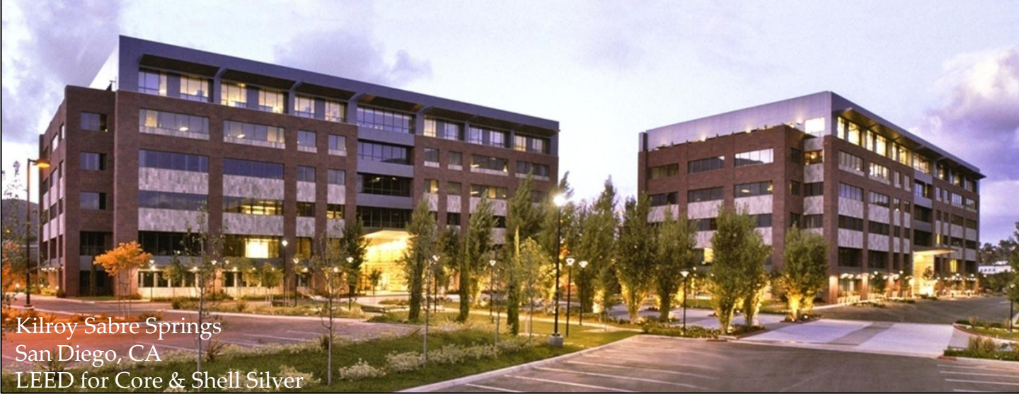
Kilroy Sabre Springs San Diego, CA LEED for Core & Shell Silver