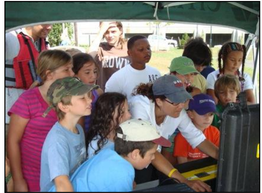
Rozalia Project Education Outreach

Kilroy Realty Corporation decided to sponsor the Rozalia Project because this nonprofit makes a significant, positive environmental impact through strategic educational outreach and targeted programs. We look forward to sponsoring their 2012 Summer Trash Tour.