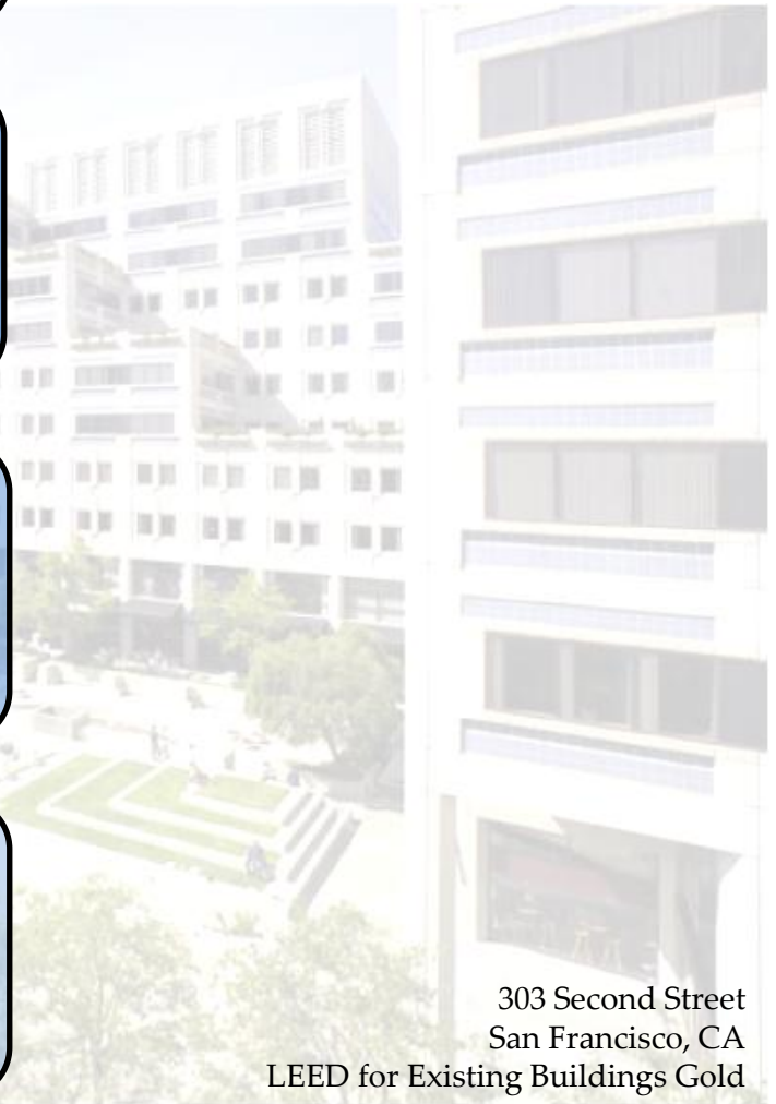
303 Second Street San Francisco, CA

Certifies multi-building projects, focuses on site selection, connectivity, and environmental performance